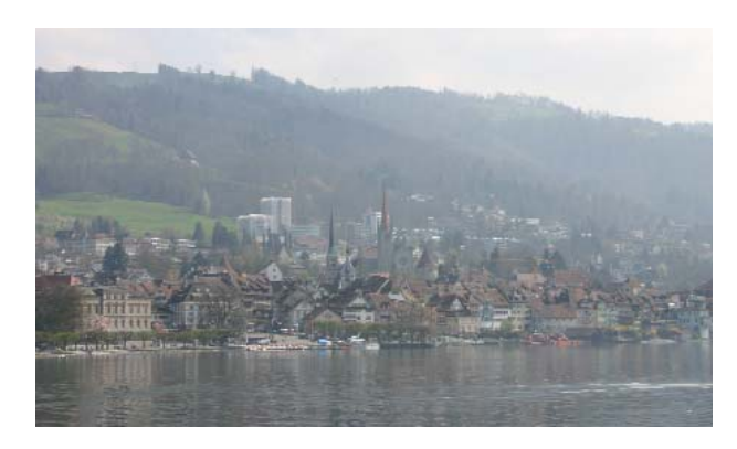
City of Zug: "Impression of affluence"

If Zurich already looks like a wealthy city, the impression of affluence can be increased by taking the half-hour train ride from Zurich central station to Zug. Zug is both a city and the capital of the Swiss canton of the same name. Two things stand out about the canton. First, the canton of Zug has the highest per capita income in Switzerland. In 2002 it was 159 per cent of the national average at more than 77,000 SFr per head. Second, Zug also boasts the lowest rates of income taxation in Switzerland. In no other canton do people pay less income tax than there, whether they are on lower or higher incomes. But of course the absolute tax saving will be much greater for high-income earners.<sup>56</sup> The comparatively high wealth of Zug means that the canton has to pay 120 million SFr into a federal compensation scheme for poorer cantons, and apart from that there is a long tradition of voluntary contributions for Zurich's cultural institutions which the inhabitants of Zug also use.