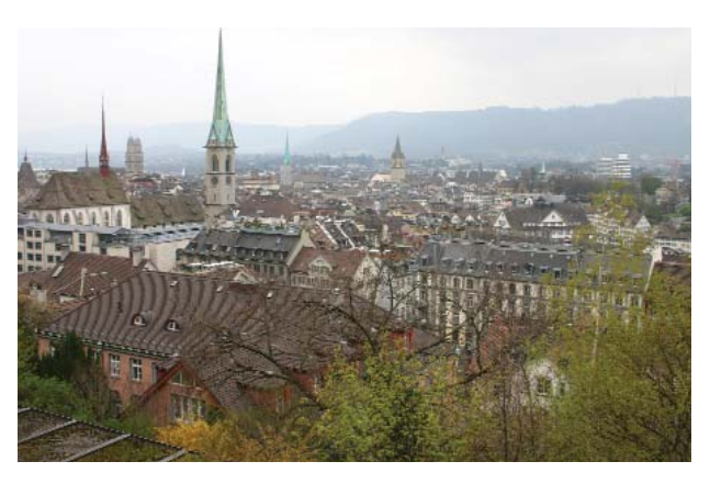
City of Zurich: "The dominant economic centre of Switzerland"

with the canton of Zurich. Zurich is the Swiss canton with the highest number of inhabitants – 1.247 million people spread over 12 districts that again comprise of 172 municipalities. It is perhaps confusing that the agglomeration of Zurich does not stop at the borders of the canton of Zurich. In fact, the agglomeration reaches into the neighbouring cantons of Aargau and Schwyz. Above even this level there is what might be described as the Greater Zurich area. The total population of this metropolitan area is 1.65 million people. More importantly, and less technically, it is the dominant economic centre of Switzerland.