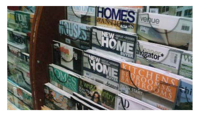
Australian property magazines: "Not just four walls with a roof on top"

at least, to find one's home far away from home. And thus, about one hundred years later, in 1937, a British visitor to Australia noted "They call houses homes in this country." To explain this psychologically one should perhaps think of the way that expats, even today, try to make themselves "at home" in their new countries.