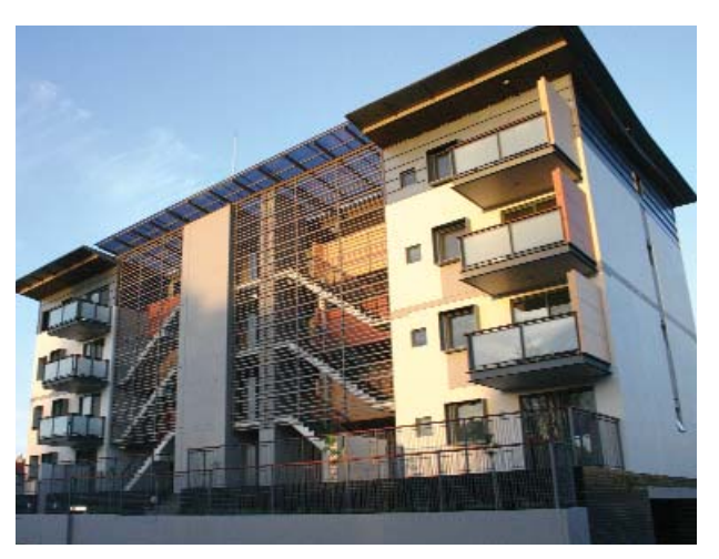
City West project in Sydney: "You would not guess that this is an affordable housing project, would you?"

words: We have seen that there are some people who will always need some kind of support for their housing and others that will need it only temporarily. We want to provide an integrated solution for both of them." What does this mean in practice? "It means that we are trying to build sustainable and balanced communities of tenants in our properties. For example, seventy per cent of our tenants will have an income from employment. We also encourage the formation of tenant groups for two reasons: To create communities for them and to have these groups as a kind of feedback mechanism for the CWH management." Apparently, CWH has been successful with this strategy: "We regularly survey our tenants, and satisfaction levels are well over ninety per cent. But beyond these figures, there are the personal stories that show us what CWH has achieved for our tenants. I am always happy to see one of our tenants live in one our units for a few years and then to hear that now his personal financial situation has improved so much that he can move out and go into the regular property market, often even become a property owner."