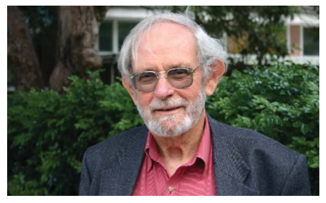
Professor Patrick Troy: "The suburban house provided a healthy comfortable environment"

Obviously, the practical reasons for building on big lots gradually disappeared towards the turn of the century. Once new methods of transport, refrigeration, waste collection and public sewerage systems had been introduced and general standards of living had further improved, nobody still needed to live on a big plot of land in order to be self-sufficient (although according to Professor Troy, even today fifteen per cent of the salads consumed in Melbourne are home produced).