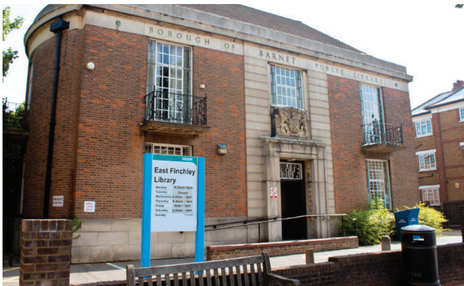
East Finchley Library

The scope of One Barnet was broad – it looked at every aspect of the services provided by the Council; it considered the way we work and engage with residents and partners; and it assessed the way we organised ourselves. Each One Barnet project – of which there were 29 between 2010 and 2014 – adhered to one or more of the three One Barnet principles. Fundamental to One Barnet was a staged approach, with each project following a common development path as part of the programme: