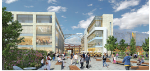
Artist's impression of Brent Cross, post-regeneration