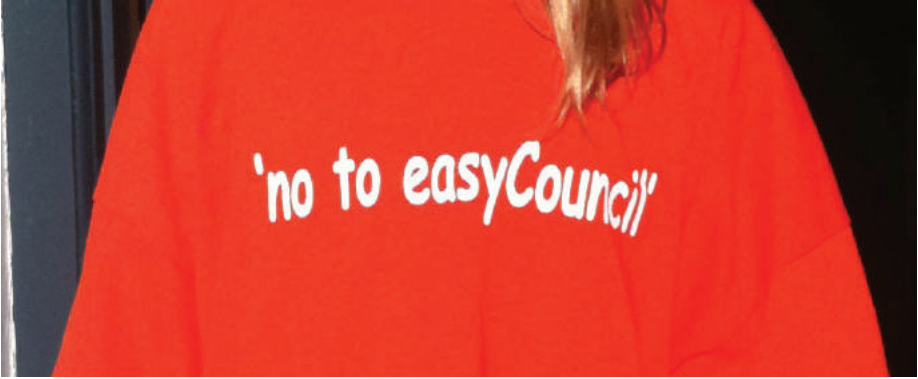
Opposition to easyCouncil

Ultimately, the Judicial Review process led to a delay of five months to the commencement of the customer services and back office contract and a six month delay to the DRS contract. This came at considerable cost to the tax payer, both in terms of legal fees and maintaining interim arrangements until the new arrangements could commence, as well as creating uncertainty for staff.